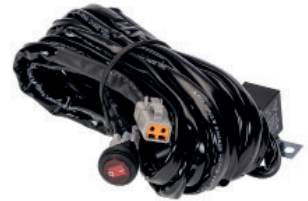
User Friendly Connection Kit Available!