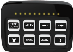
PANNEAU DE CONTRÔLE 8 BOUTONS