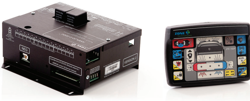
Zone Technologies full equip emergency system