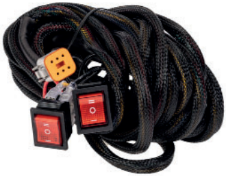
Use wire harness #67220Z to make full use of it