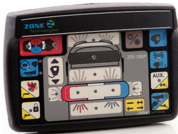
(police keys shown)