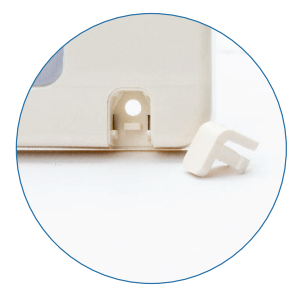
Hidden mounting holes